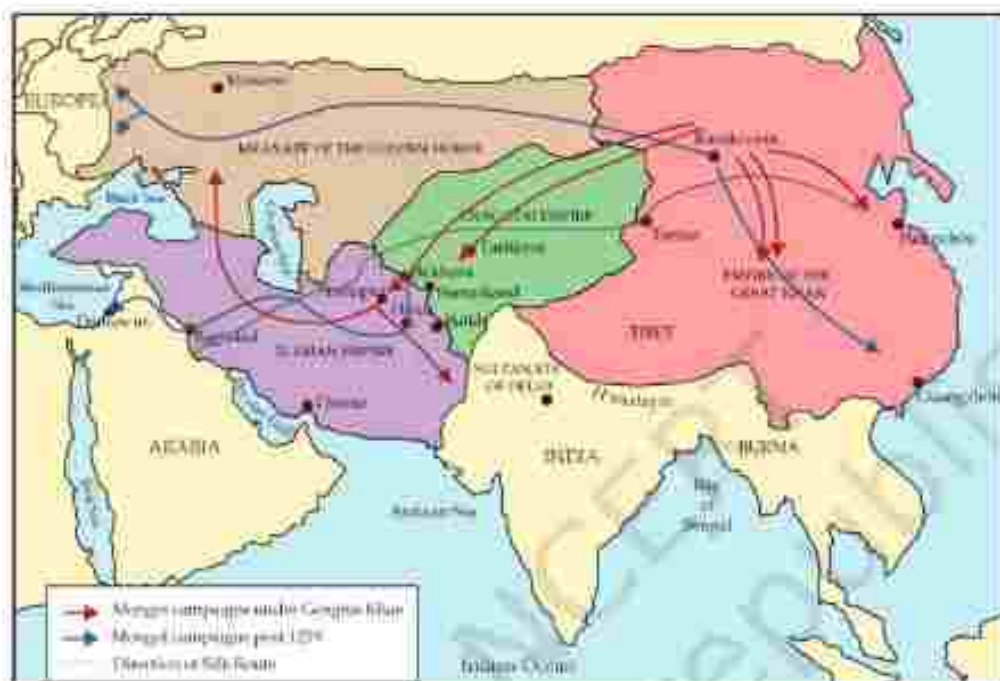
MAP 2: The Mongol Campaigns

They continued north into Mongolia and to Karakorum, the heart of the new empire. Communication and ease of travel was vital to retain the coherence of the Mongol regime and travellers were given