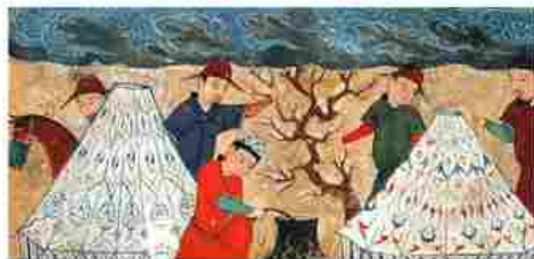
Ghazan Khan and Chaghatay Khan in camp.