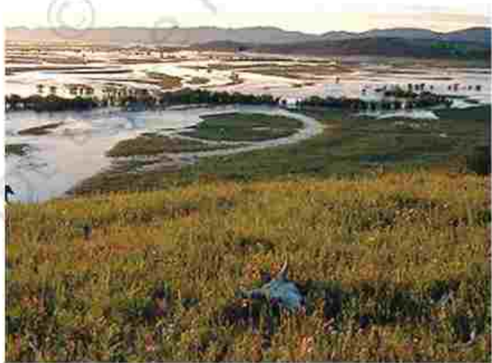
Onon river plain in flood.

The Mongols were a diverse body of people, linked by similarities of language to the Tatars, Khitan and Manchus to the east, and the Turkic tribes to the west. Some of the Mongols were pastoralists while others were hunter-gatherers. The pastoralists tended horses, sheep and, to a lesser extent, cattle, goats and camels. They nomadised in the steppes of Central Asia in a tract of land in the area of the modern state of Mongolia. This was (and still is) a majestic landscape with wide horizons, rolling plains, ringed by the snow-capped Altai mountains to the west, the arid Gobi desert in the south and drained by the Onon and Selenga rivers and myriad springs from the melting snows of the hills in the north and the west. Lush, luxuriant grasses for pasture and considerable small game were available in a good season. The hunter-gatherers resided to the north of the