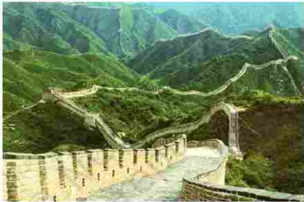
The Great Wall of China.

marginal losses. Throughout its history, China suffered extensively from nomad intrusion and different regimes – even as early as the eighth century BCE – built fortifications to protect their subjects. Starting from the third century BCE, these fortifications started to be integrated into a common defensive outwork known today as the 'Great Wall of China' a dramatic visual testament to the disturbance and fear perpetrated by nomadic raids on the agrarian societies of north China.