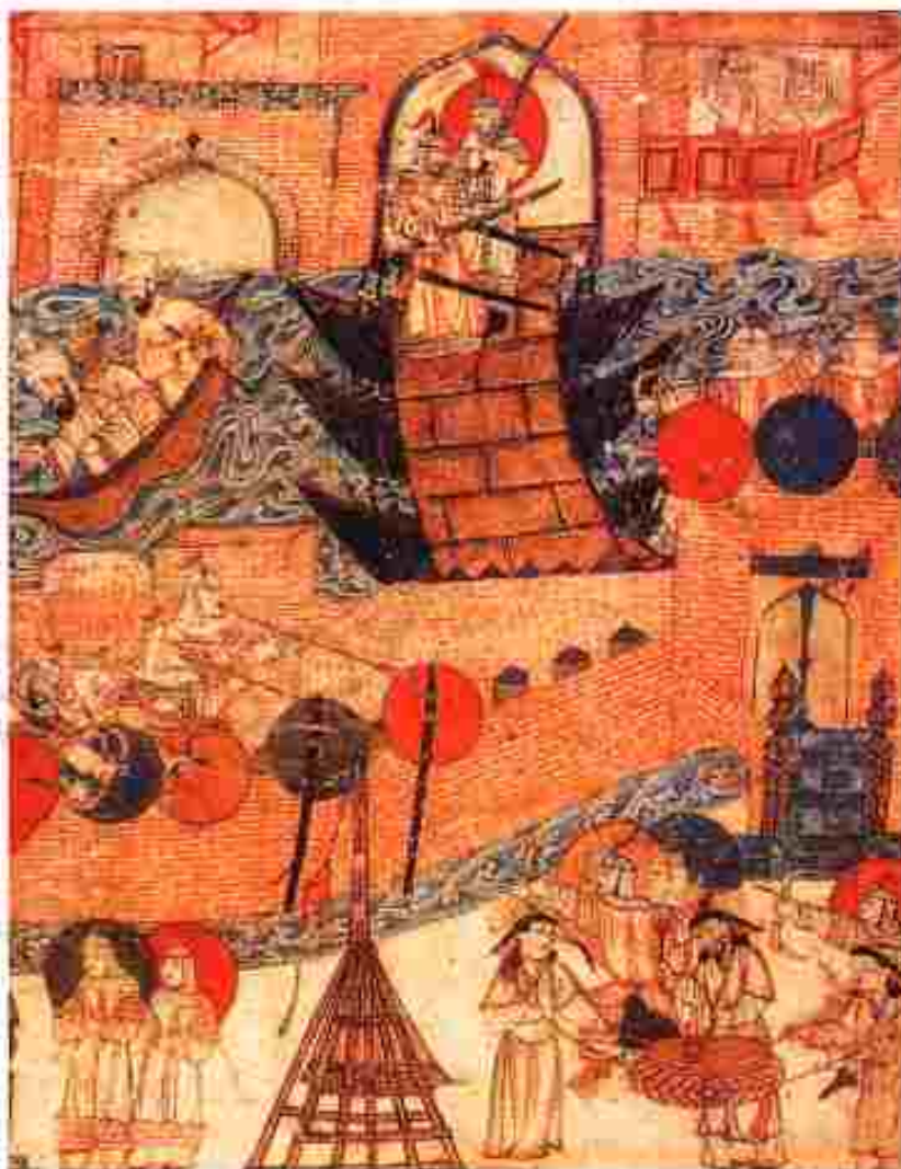
The Capture of Baghdad by the Mongols, a miniature painting in the Chronicles of Rashid al-Din, Tabriz, fourteenth century.

Today, after decades of Soviet control, the country of Mongolia is recreating its identity as an independent nation. It has seized upon Genghis Khan as a great national hero who is publicly venerated and whose achievements are recounted with pride. At a crucial juncture in the history of Mongolia, Genghis Khan has once again appeared as an iconic figure for the Mongol people, mobilising memories of a great past in the forging of national identity that can carry the nation into the future.